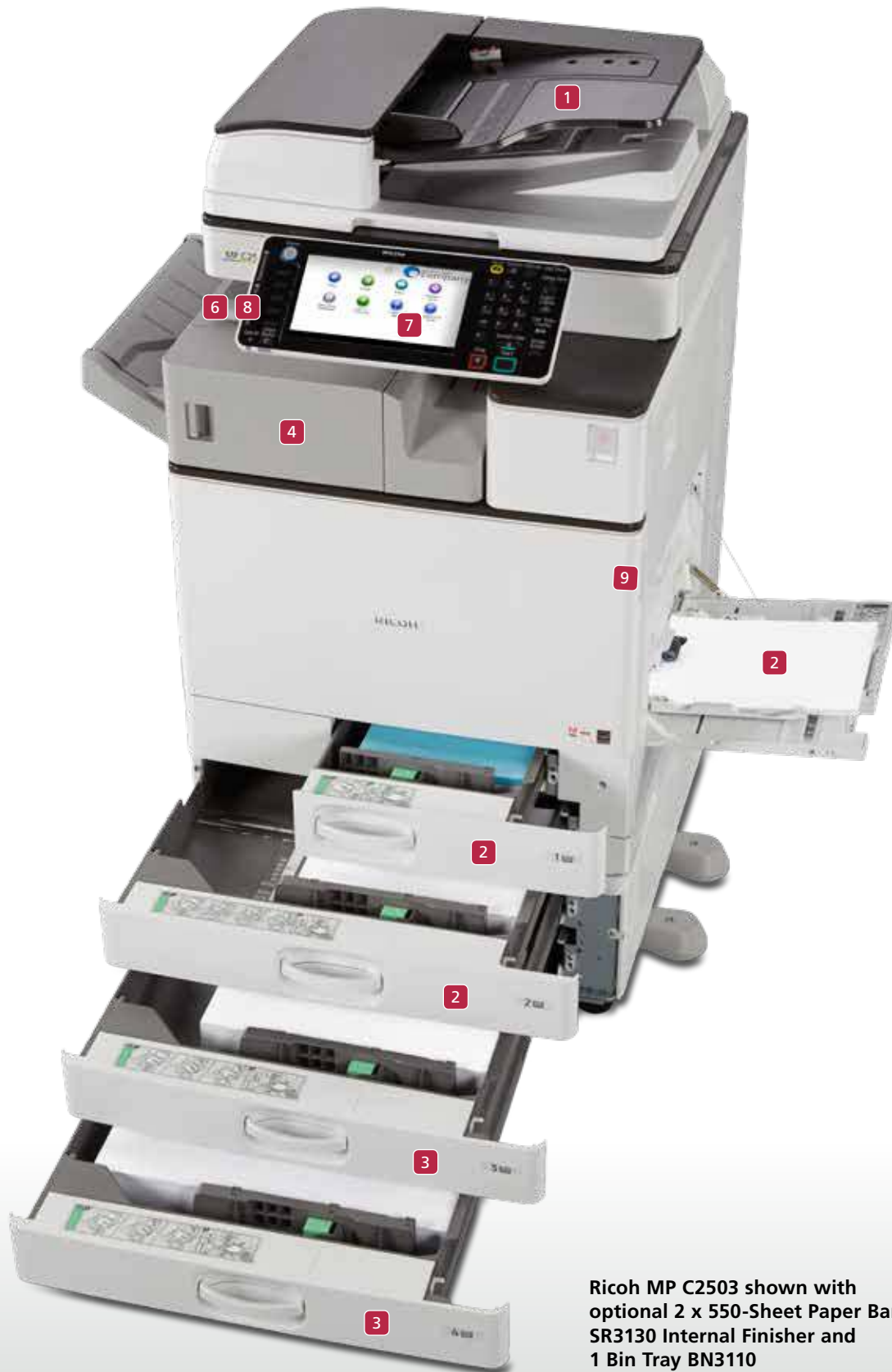
Ricoh MP C2503 shown with optional 2 x 550-Sheet Paper Bank, SR3130 Internal Finisher and 1 Bin Tray BN3110